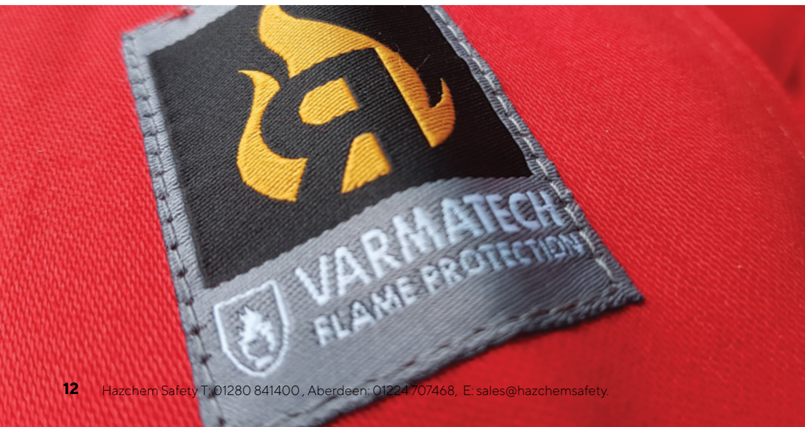
CE Marked (where Applicable)