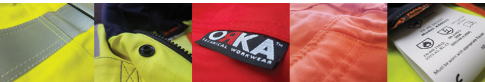
Hi-Vis Certified Reflective Tape

VARMATECH™ FR Fabrics are used in the production of ORKA® FR Workwear. Each fabric provides low shrinkage FR Cotton, with the addition of Polyester in some blends to provide enhanced performance in industrial washing. Varmatech™ fabric blends are strong in both the warp and the weft, and are tested to European Norms including EN ISO 11612 (Heat & Flame) and EN ISO 11611 (Welding), with some fabrics also being tested to IEC 61482 (ARC Flash Protection) Choose ORKA with Varmatech™ fabric for your next FR Workwear.