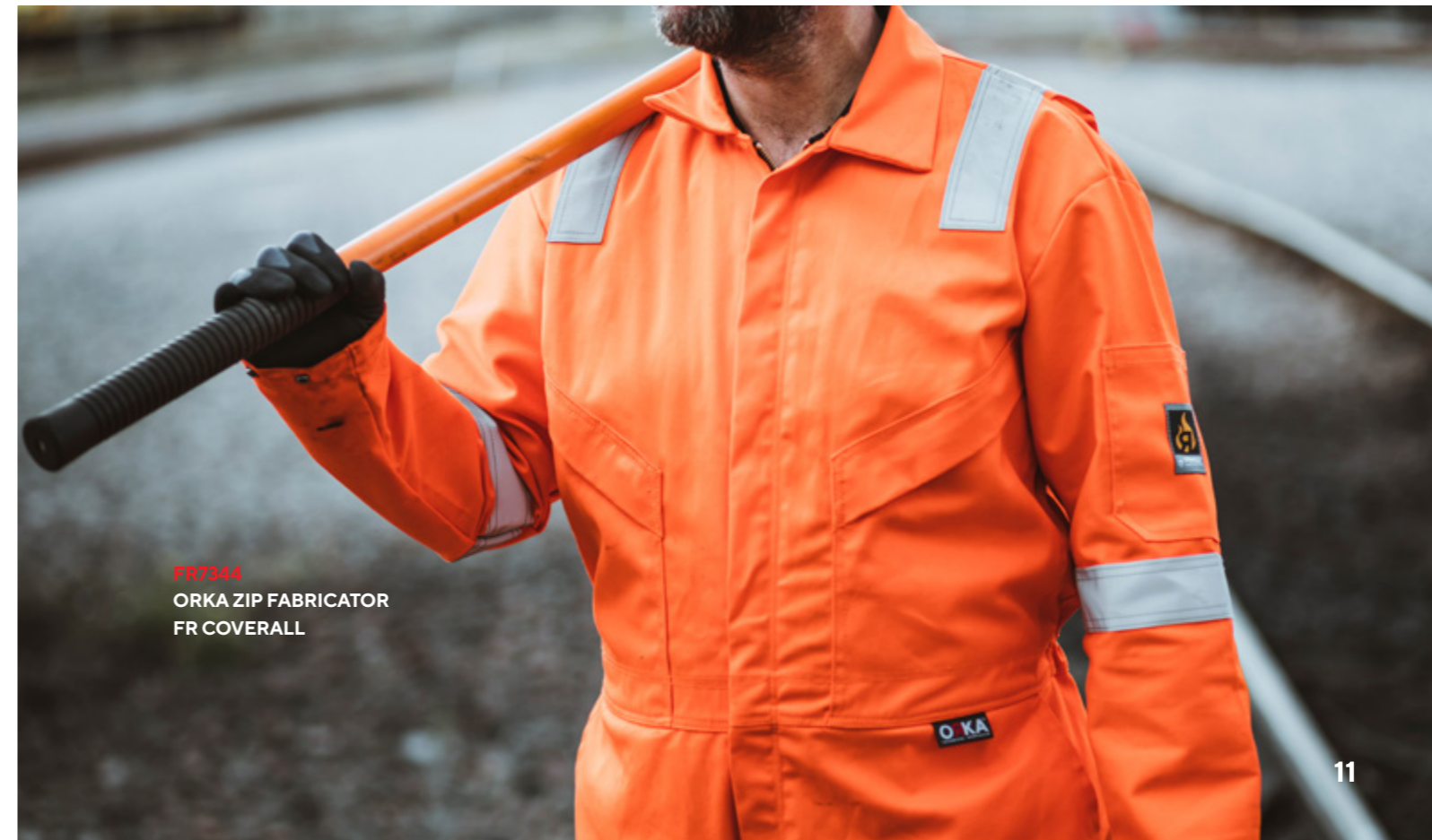
FR7344 ORKA ZIP FABRICATOR FR COVERALL