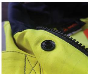
YKK Branded Zippers & Components