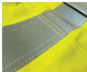
Hi-Vis Certified Reflective Tape