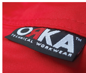
Stylish Branding & Design