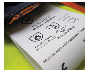
CE Marked (where Applicable)